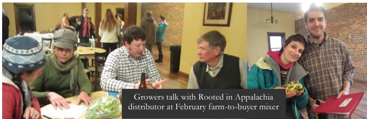
Growers talk with Rooted in Appalachia distributor at February farm-to-buyer mixer